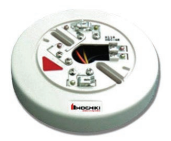
6" Base with Relay